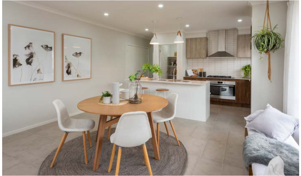
Photo is for illustrative purposes only and does not depict the home for sale. This image contains internal or external luxury upgrade items and furniture not included in the home price.